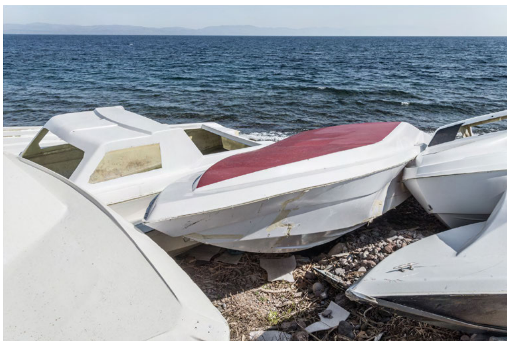
Turkish boats' wrecks on the shore in Skala Sikimineas