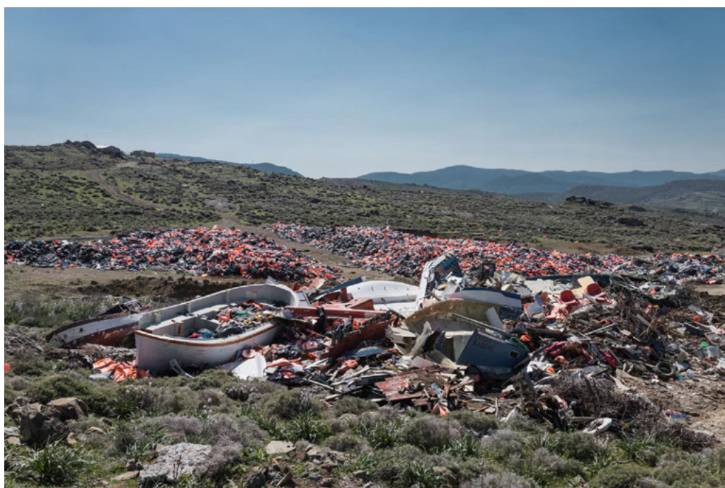
Here and above: Lifejackets and rafts in a dump in northern Lesbos