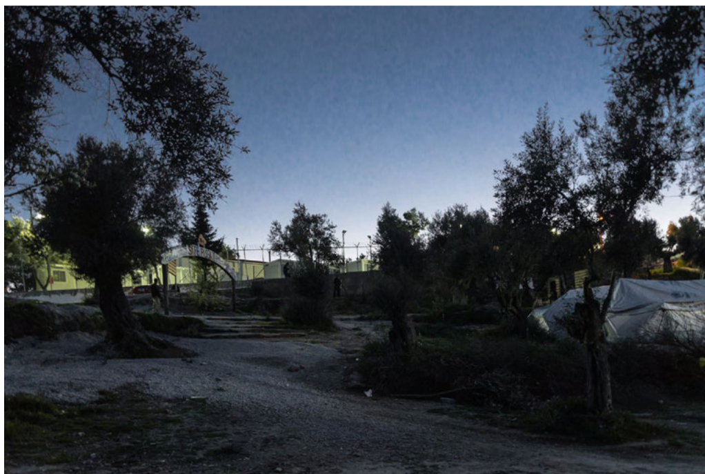
Outside the Hotspot of Moria