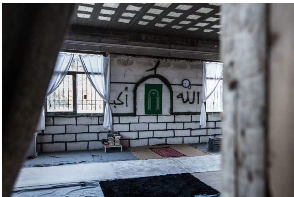
A place of worship built by migrants in the abandoned warehouse they have been occupying