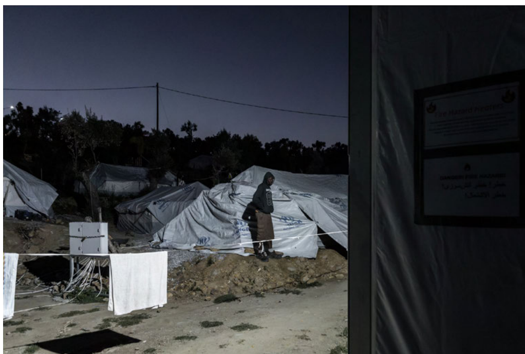
Outside the Hotspot of Moria. B., from Guinea, reached Lesbos by sea from Turkey