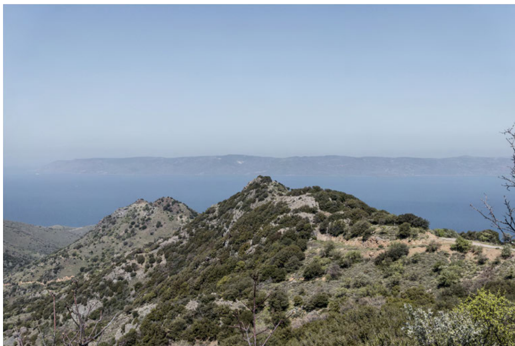
Turkish mainland seen from the top of a mountain in Lesbos