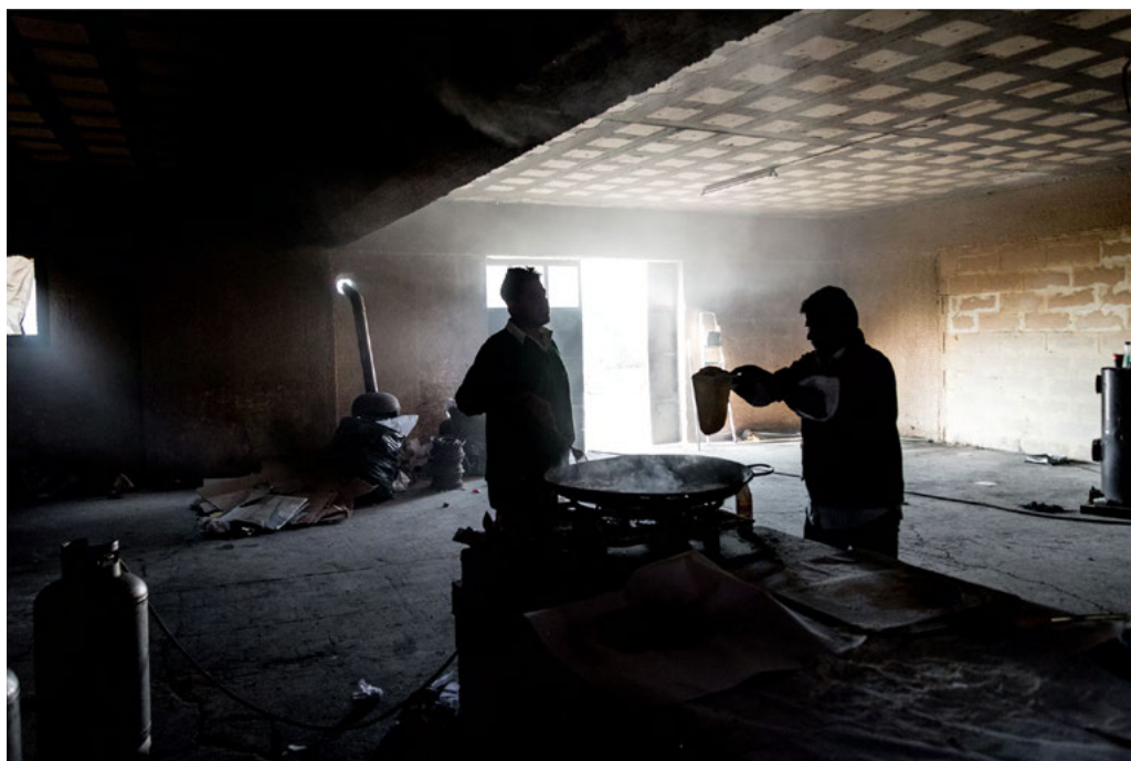
Pakistanis cooking chapati for all the migrants living in the abandoned warehouse they share with