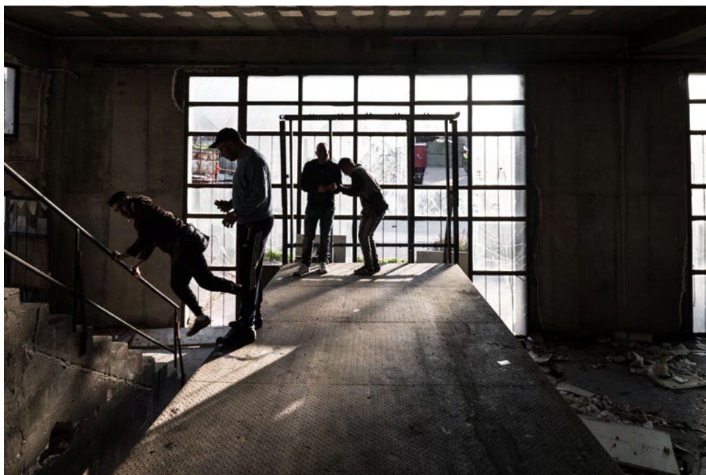
Algerian people living in an abandoned warehouse in Mytilene